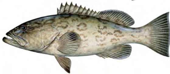
Gag ( Mycteroperca microlepis )