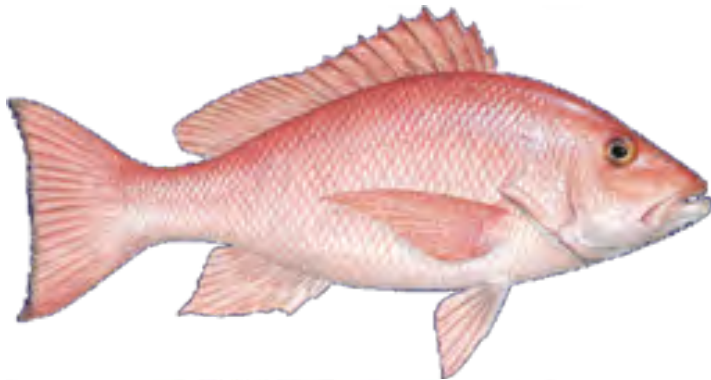
Red Snapper ( Lutjanus campechanus )