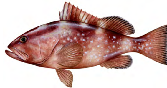
Red Grouper ( Epinephelus morio )